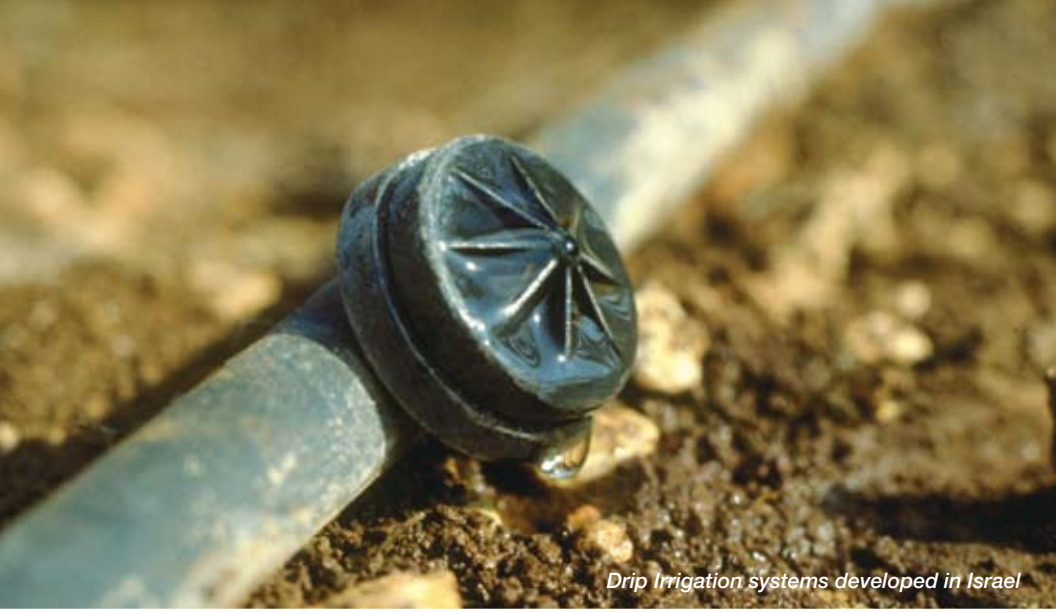
Drip Irrigation systems developed in Israel