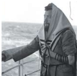
Above: Refugees from Yemen, Bosnia, Vietnam, Ethiopia and Europe.