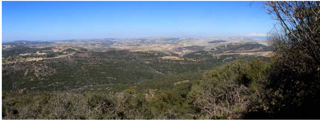
A deceptive calm: Southern Lebanon, home to 40,000 Hezbollah rockets, as seen from northern Israel in March 2011. Snow-capped Mount Hebron can be seen to the right.