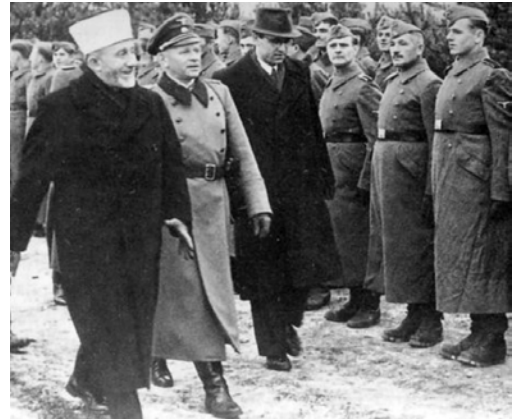
The Grand Mufti reviewing Muslim troops of the 13th Waffen SS Division

was Amin al-Husayni, the Grand Mufti of Jerusalem, sometimes referred to as “Hitler’s Mufti.” Al-Husayni was the leader of the 1936 Palestinian uprising against British rule in the Mandate. He received financial assistance from the Italian Fascists and the Nazi Secret Service. Under his leadership, the Arab Higher Committee, a proto-PLO, assassinated hundreds of moderate Arab leaders. The cycle of violence unleashed by al-Husayni continues to this day in Palestinian culture.